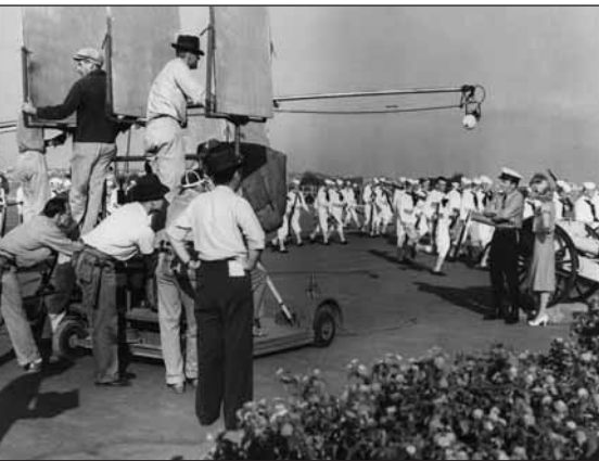
A microphone boom captures the voices of actors Virginia Weidler and Dickie Moore during the filming of Paramount’s 1935 film Peter Ibbetson .

Not all film dialogue is recorded live. Automated Dialogue Replacement or ADR is used to record new dialogue if the live track is unusable or if the director wants to change some of the actors’ lines. During ADR, actors watch a scene many times and practice matching the words to the lip movements of the characters onscreen.